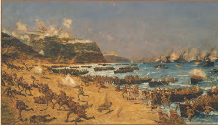
The landing at Anzac, 25 April, 1915, by Charles Dixon

At the start of the Gallipoli campaign, in April 1915, the wounded were evacuated to Egypt, but it was immediately evident that facilities there could not cope.