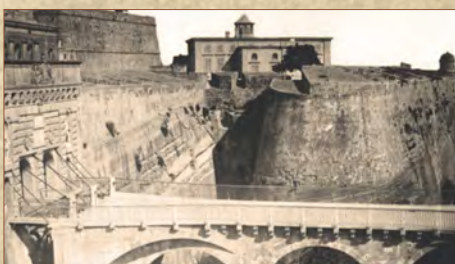
Valletta's original city gate (left) and the military gymnasium in the background — now site of the central bank

The tours also highlight points of interest on the islands - places where recovering servicemen and off duty personnel may have visited, and so can you.